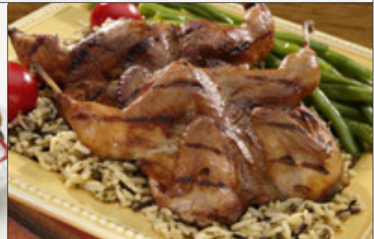
Quail, Whole, Butterfly Cut, All Natural Product #KJ734 • Size 24 x 5 oz.

Boneless Quail Breasts are perfect for many types of preparations and are pre-marinated to maintain moisture and enhance the flavor, try these skewered and grilled or fried.