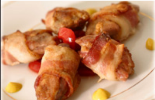
Quail Breast, Boneless, Marinated, Bacon Wrapped Product #KJ694 • Size 84 ct.

This quail is bone in and split down the backbone leaving the breast intact and in natural form making it a more economical option than the semi-boneless option and providing a dramatic plate presentation.