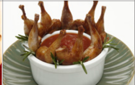
Quail, Leg, Partially Boned, All Natural Product #KJ742 • Size 150 ct.

This Bacon Wrapped Quail Leg has the thigh bone removed so the first bite is boneless and the only bone left is the drumette which acts like its own little handle. The quail is marinated before being hand wrapped and individually frozen. There is no toothpick so it must be baked, grilled, or fried from frozen in order for the bacon to stay in tact.